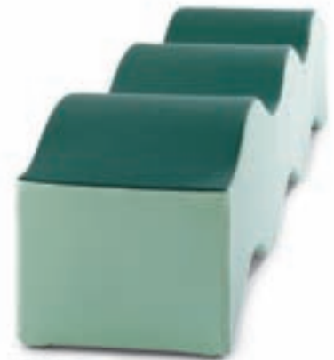
490-B96VRT Upholstered Wave Seat Optional Contrasting Textiles