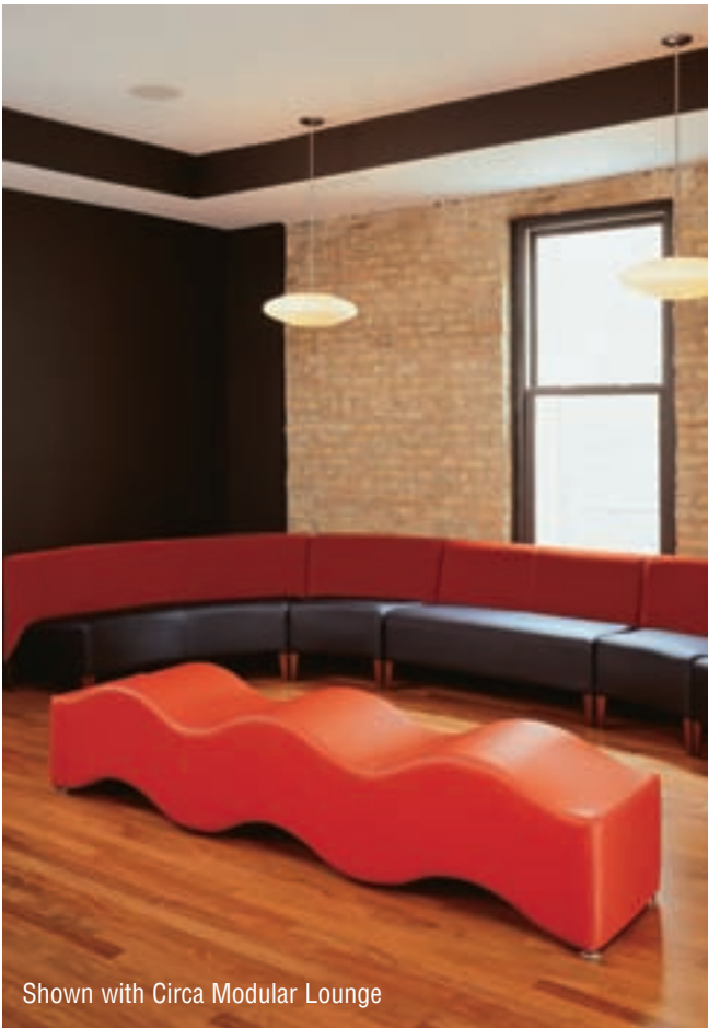
Shown with Circa Modular Lounge