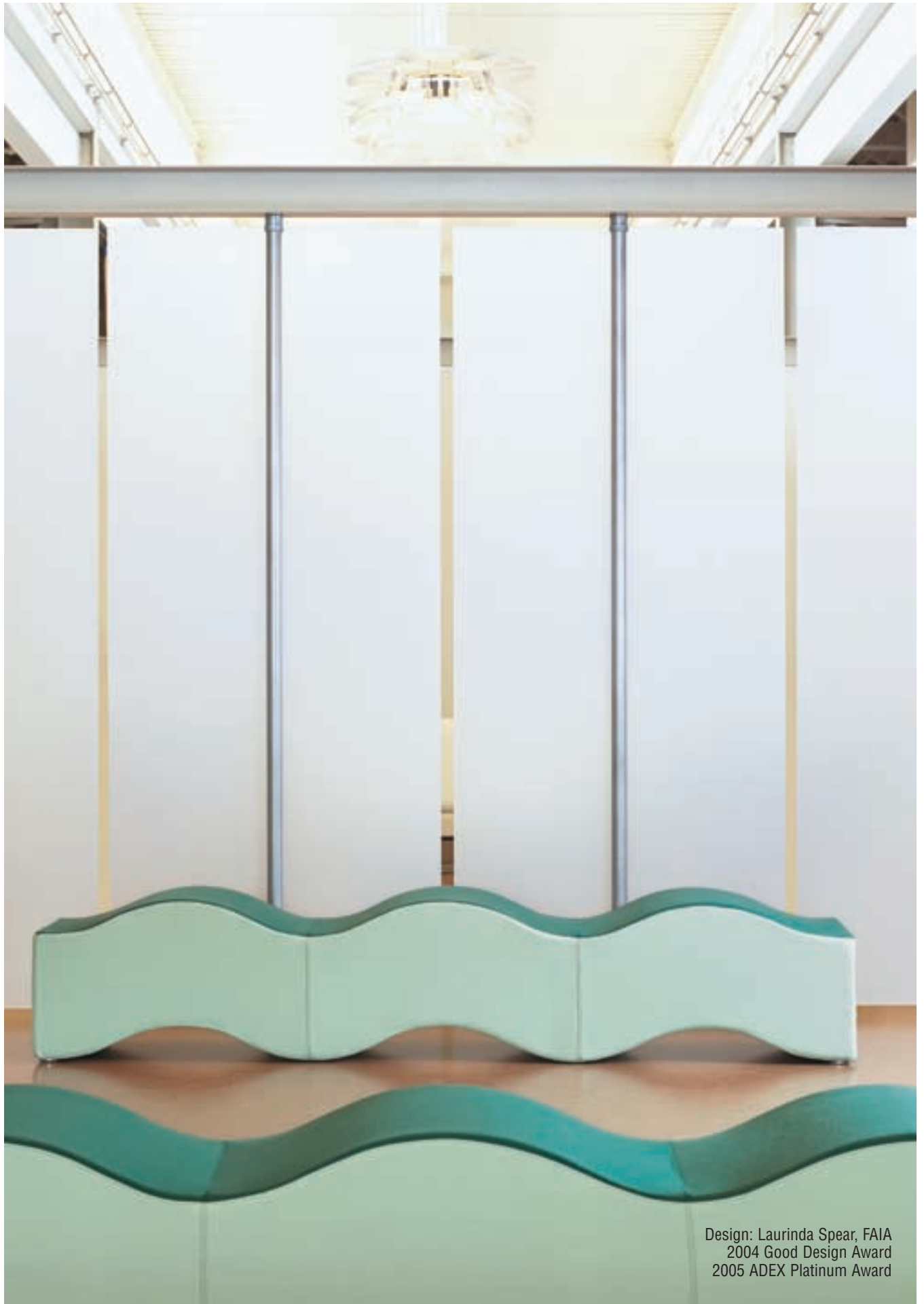
Design: Laurinda Spear, FAIA 2004 Good Design Award 2005 ADEX Platinum Award