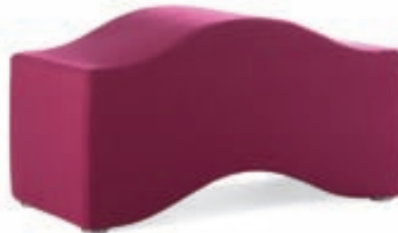
490-B35VRT Little Ripple / Upholstered Wave Seat