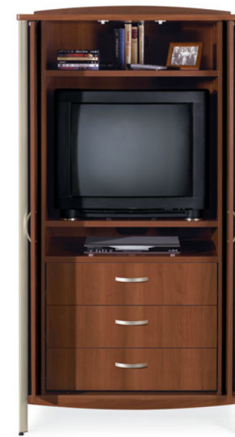
GCLTV03 (Doors Open and Retracted)