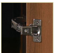
Commercial Hinges Cabinet doors are mounted on commercial quality hinges that provide a full 170 degree opening for unobstructed access.