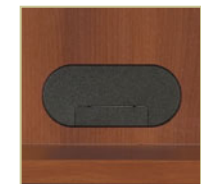
Wire Management TV, DVD, and VCR cables & wires are easily managed through oversized wire grommets