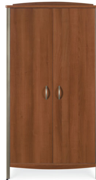
GCLTV03 (Doors Closed) TV Cabinets with Pocket Doors, shown in Avant Honey with Arc fascia and Arc handles.

Maintenance staff will appreciate the oversized wire management grommets in the back panel that provide hassle free access for cables to connect to wall power and communication outlets. A full width opening at the rear of the TV surface and equipment shelf provides easy access for cable connections between the TV and DVD, VCR and cable boxes. Integrated openings on both side gables ensure that equipment is properly ventilated to reduce the risk of overheating.