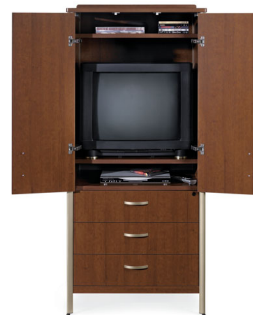
GCLTV02 (Doors Open)