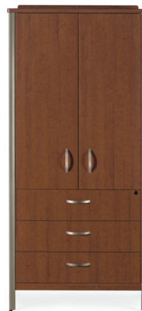
GCLTV02 (Doors Closed) TV Cabinets with Hinged Doors, shown in Shaker Cherry with Linear fascia & Arc handles.