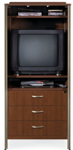
GCLTV01 (No Doors) TV Cabinet, shown in Shaker Cherry with Linear fascia and Arc handles.